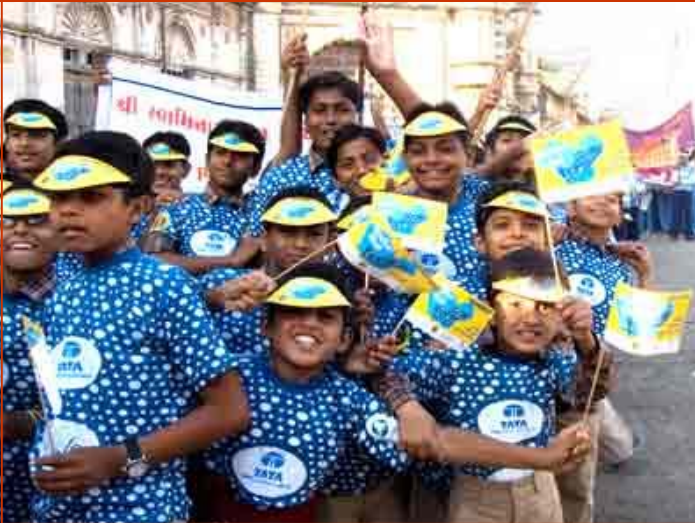
Whale Shark Parade in Porbander