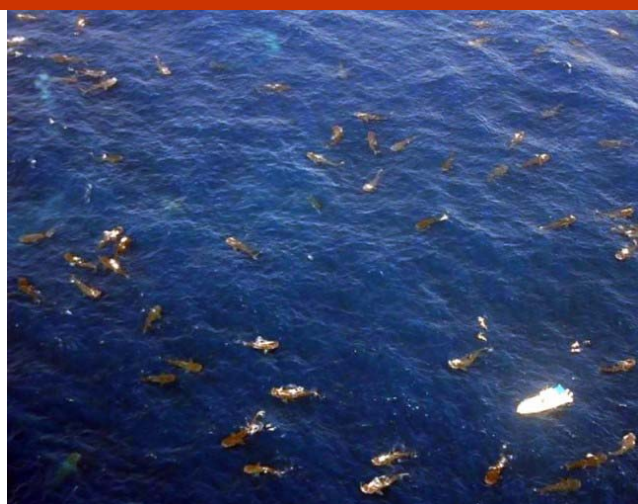
Aerial photo of whale sharks in the Afuera

October 5-12, October 12-18, 2012, White sharks in Mexico